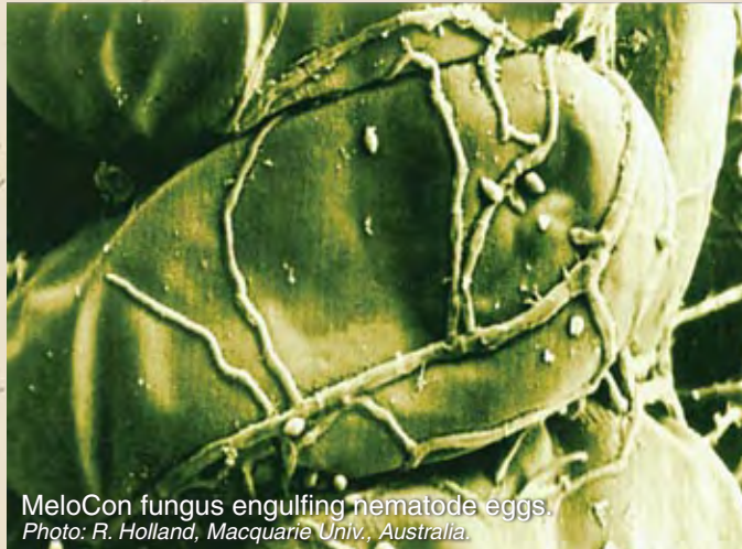
MeloCon fungus engulfing nematode eggs.

A biopesticide, MeloCon has minimal impact on the environment and non-target species. "But there is nothing